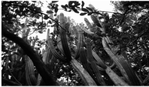
Figure 1: Trees of Pilosocereus robinii growing in the Florida Keys. These are estimated to be 5-6 m tall.